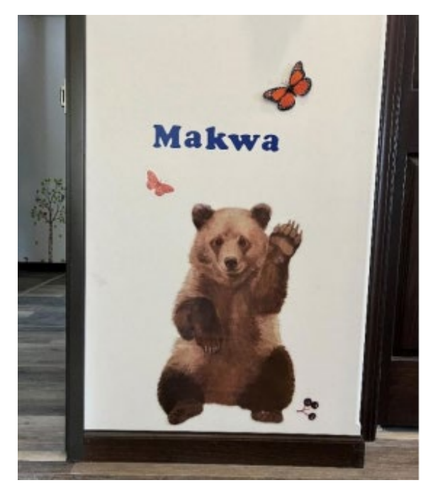
Do you think it has an impact on the families or the caregivers who are also coming in?

Yeah, yeah. You notice their reactions. They just look at it and smile. They're curious about it, you know? I feel like it adds a little joy to their day, despite the things that they're there to be seen about or to talk about.